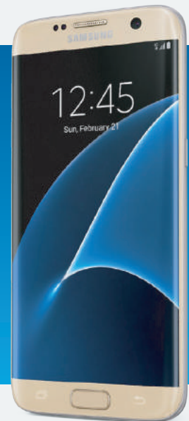
SAMSUNG Galaxy S7 edge